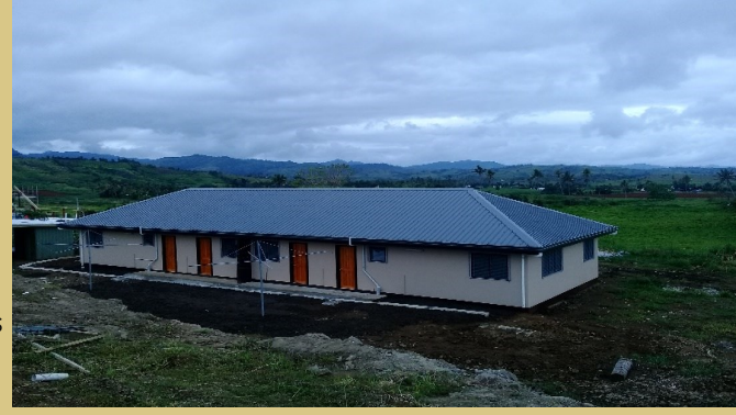
Waimaro Nurses Quarters, Ra. order to maintain a sustainable business growth in the long term.

more by necessity rather than by choice, in