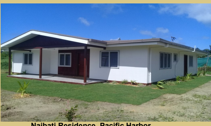
Naibati Residence, Pacific Harbor