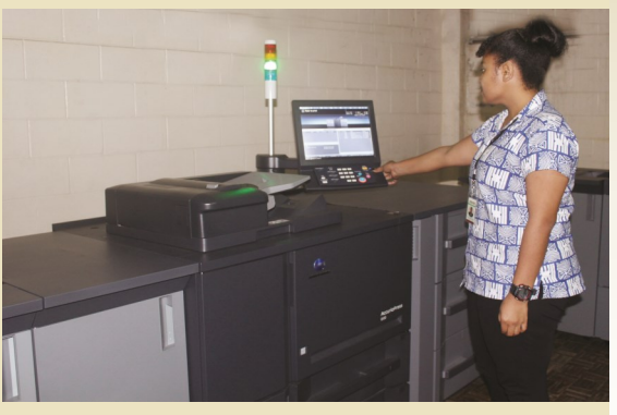
Konica Minolta Accuriopress 6120