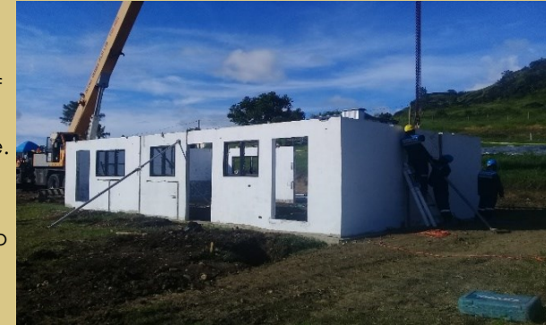
Humes Precast Wall Panels

mass production of high quality common building components in a factory facility, which are then transported and put together on site. This concept was developed in house by BIL to address the quality of material and construction deficiencies identified in the buildings and structures that were destroyed by TC Winston. This concept also substantially reduces construction time compared with traditional construction methods.