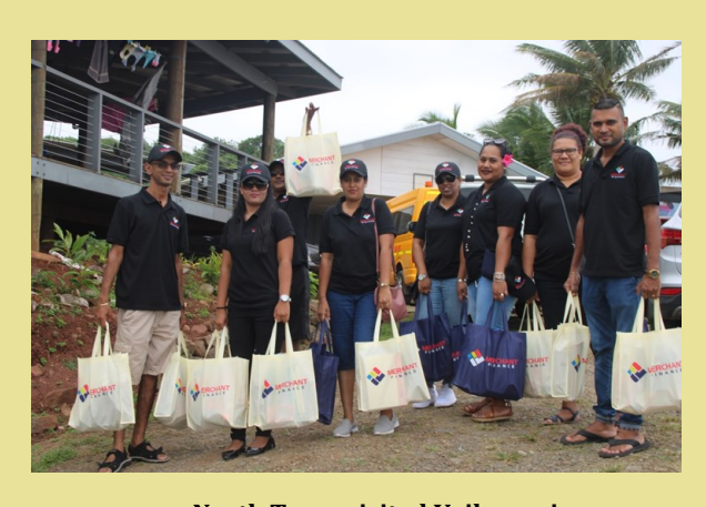
North Team visited Veilomani Orphanage in Savusavu