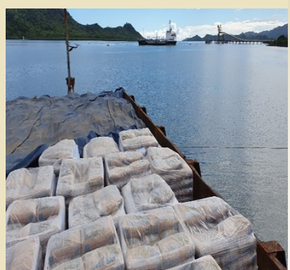
Barge according at Malau Port, Labasa

PCL ensures to go extra mile for its customer's satisfaction at all times. Wherever possible, PCL also assist customers in operational matters relating to its business as now, customers in Vanualevu, Fiji gets the cement delivered to their door steps via barge. Moreover, PCL had recently launched its "West Warehouse & Dispatch Centre"