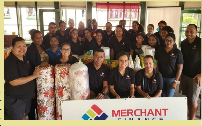
Central Team visited Samabula Old Peoples Home