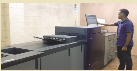
Konica Minolta Accuriopress C6100