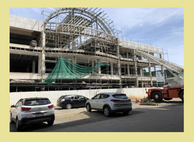
JetPoint Stage 5 project – 3 level retail & office building