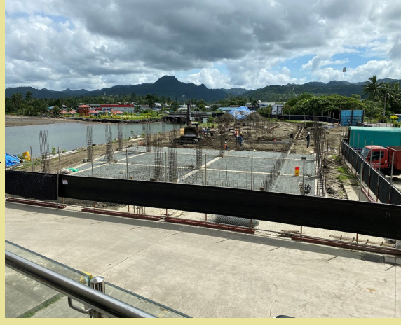
HarbourPoint Stage 2 Project - Convention centre and retail space.

Our construction projects in JetPoint, Nadi and HarbourPoint, Lami continues. However, some minor delays have been caused by the lockdowns. We anticipate the JetPoint project completion by August 2020 and the HarbourPoint project completion by May 2021.