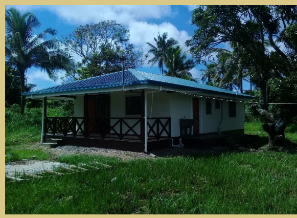
Ratu Veikoso Teachers Quarters, Tailevu