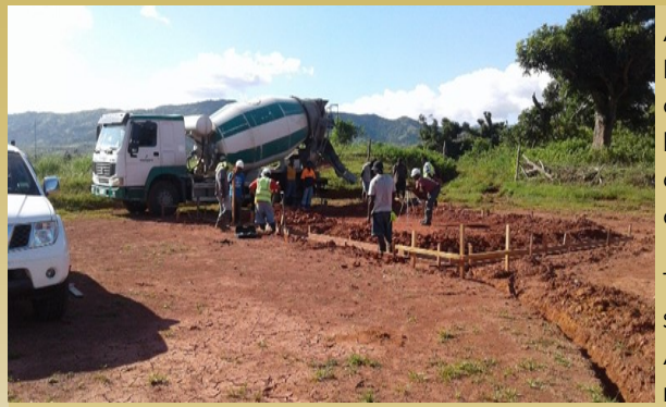
Standard Concrete Ready-mix

A perfect opportunity came up when Tropical Cyclone Winston hit Fiji in February 2016. It created a huge and sudden demand for fast construction quality homes and schools rebuilding. Utilizing its capabilities and expertise in precast wall panel manufacturing, BIL successfully capitalized on this sudden new demand through the introduction of its 'Basic Homes' precast modular housing product.